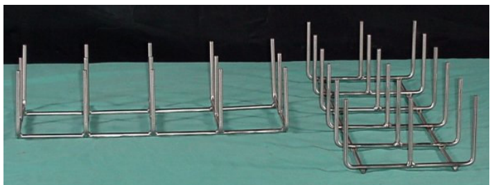
SR-016 - Peg Style