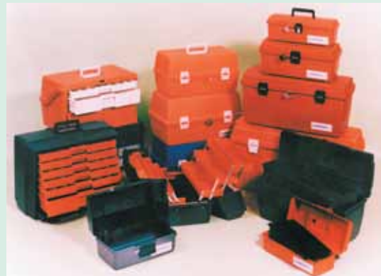
Hard-Sided Emergency Boxes Page 5