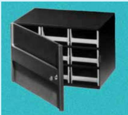
Key Locking Cabinets Page 5