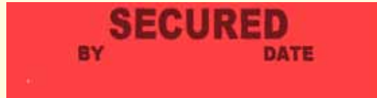
Tamper Evident Tape Page 4