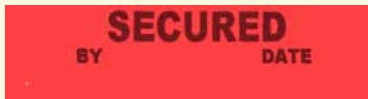
Tamper Evident Tape Page 4