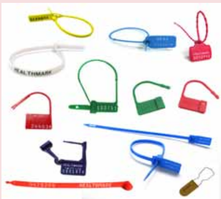
Tamper Evident Locks Page 2

A complete line of products for the security and use control of emergency supplies, equipment, pharmaceuticals and other items requiring tamper evidency and use-control