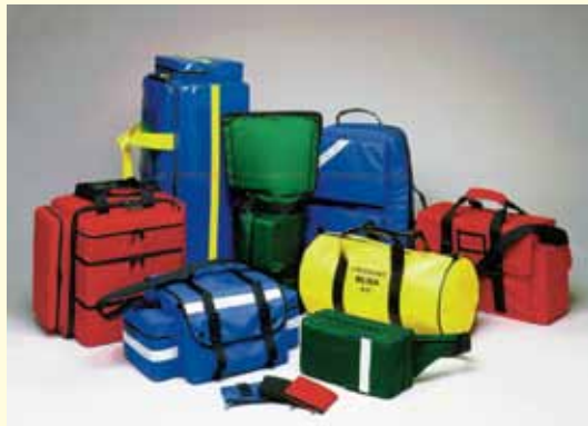
Soft-Sided Emergency Cases Page 7