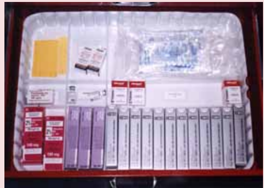
Crash Carts & Accessories Page 8