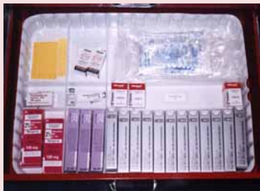
Crash Carts & Accessories Page 8