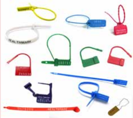
Tamper Evident Locks Page 2

A complete line of products for the security and use control of emergency supplies, equipment, pharmaceuticals and other items requiring tamper evidency and use-control