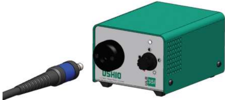
Figure 2 Fiber-Optic Bundle