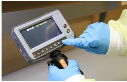
Operating Camera: Figure 1