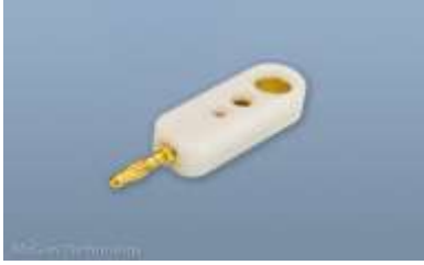
Tri-Hole Electrode- MMTRI-0022A