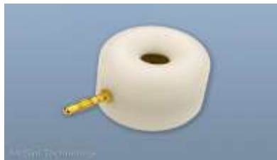
Ring and Brush Electrodes-MMLSE-0029