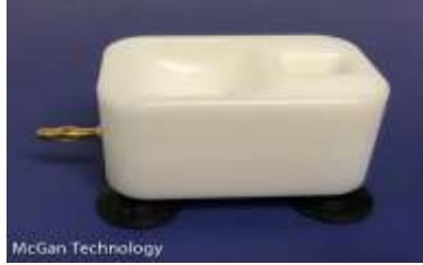
Saddle Block- MMSBT-170