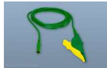
Ground Wire with Alligator Clip