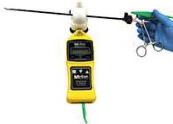
Insulation Tester MM513-100