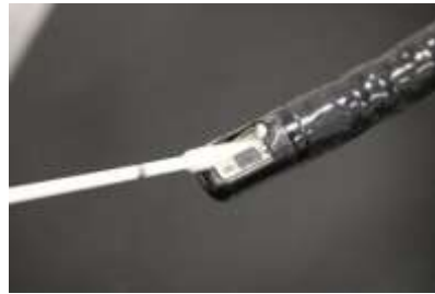
Fig. 3 Fully Raised