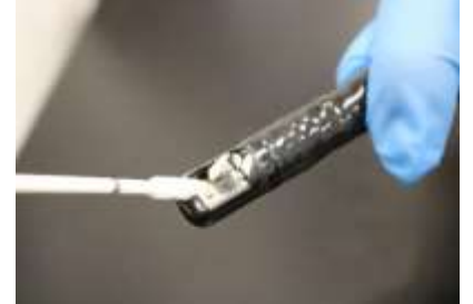
Fig. 3 Raised 45 degrees