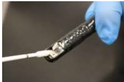
Fig. 3 Fully Lowered