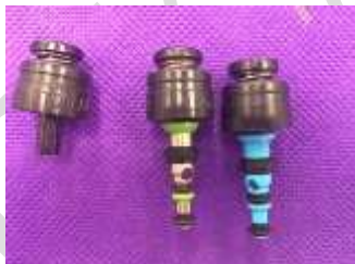
Example Valves to be tested

Should any of the pads indicate there is residual soil, re-clean the valves/caps (according to facility policy) and then retest. Record your results in a log. Once all three pads are negative proceed to the next step in your facility's process. All test results must be documented.