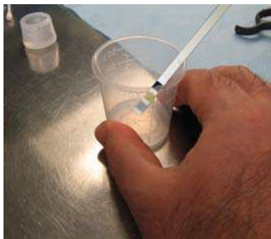
Capture and test the solution