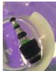
Valve in Cup