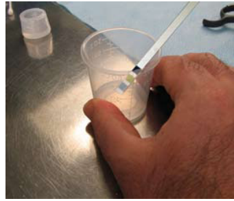
Capture the solution and the Test the solution